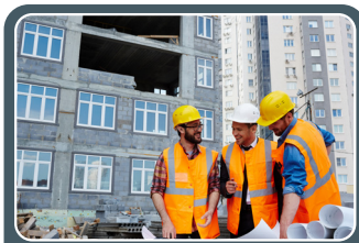
Building and Construction